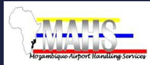
Moz. Airport handling services