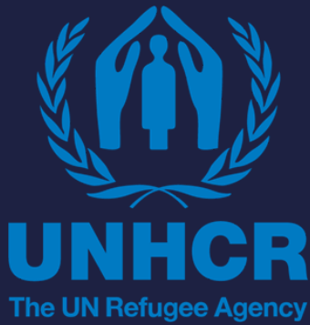
United Nations – Refugee Agency